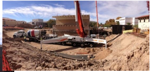
Undergraduate Learning Center