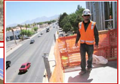
South side of building from 'Greenway'– Scene Shop & Rehearsal Room