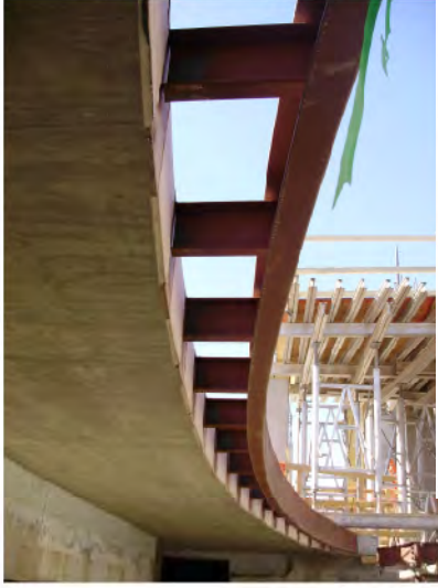
Orchestra Pit-Stage Edge